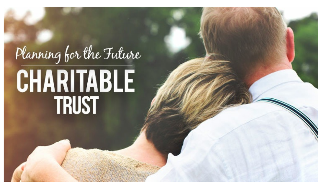
What is a Charitable Trust?